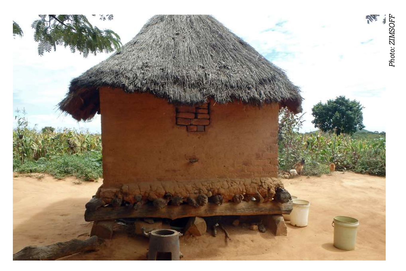
A traditional granary for seed storage and food.

Some of these farmers also related how different seeds from the same maize cob may have different characteristics. "On a maize cob, different parts of the cob are used for different purposes. The seed from the tip of the cob is used for early maturity, the middle part is used for medium maturity and the bottom is used for late maturity."