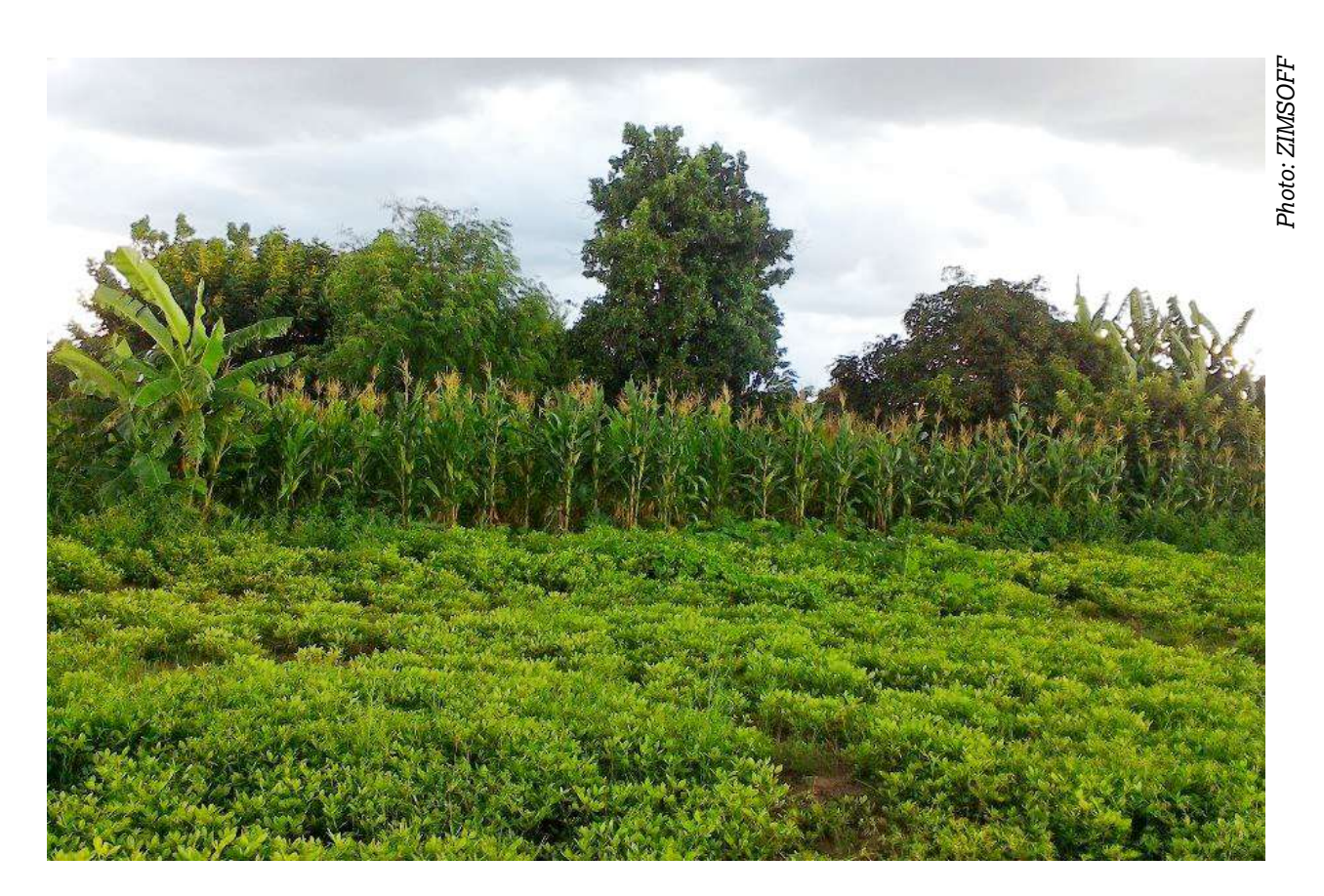
A mixed garden with ground nuts, bananas, maize and trees, in Zimbabwe, in 2018.

Farmers prefer and trust local varieties of seeds that are saved on the farm, as they know where the seeds come from and how they were selected. Farmers also know, because the seeds are grown locally, that they are productive, reliable and adapted to the local ecosystem. Most importantly, the seeds will produce food of desired nutritional value and taste. Additionally, this study confirms that some of these local seeds have medicinal characteristics and may also have cultural and spiritual significance.