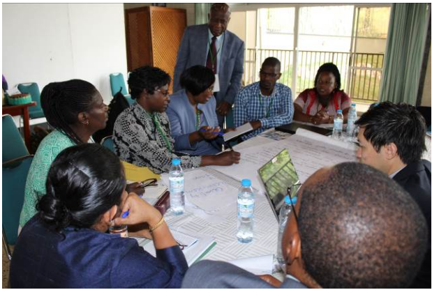
Participants during group discussions

Key issues/comments from first group work