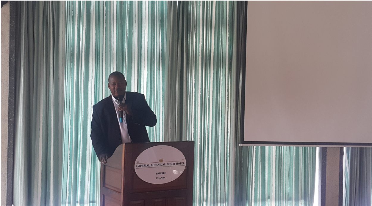
Presentation of country issues